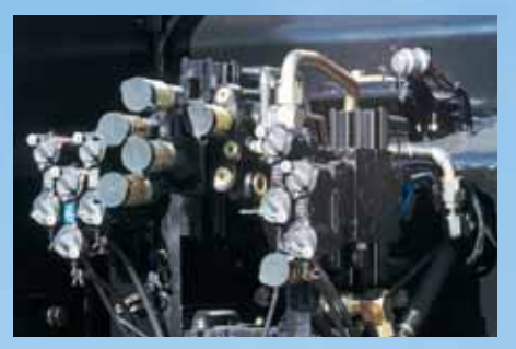
Up to 9 remote valves and MegaFlow™ can be built into any T9000 model. Seven remote valves and power beyond are pictured.